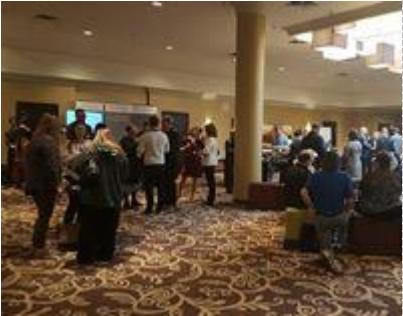
Networking during the Reception while Crestwood performed.